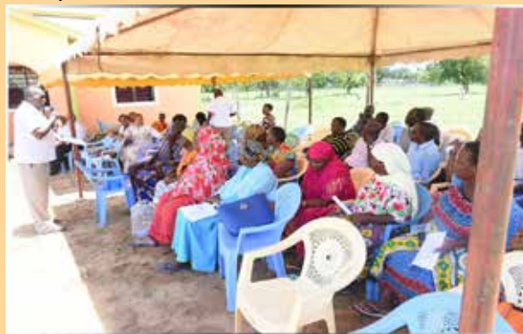
Mnarani Ward residents attending a Citizen Public participation Forum at MTG Grounds.

The board is keen to ensure a people-centered and people-driven development as enshrined in the constitution. Since sworn in office, the board has prioritized citizen involvement and participation in development agenda and projects from the start so as to achieve inclusive urban development.