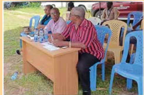
Members of the Kilifi Municipal Board during the citizen public participation forums held in the four wards of the Municipality