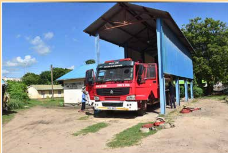
Municipality of Kilifi makeshift fire station

The Municipality of Kilifi through Kenya Urban Support Programme (KUSP) has set aside funds for the construction of a modern fire station infrastructure. The new fire station once complete will consist of offices, fire engine sheds, garages and firefighting staff houses. Besides the municipality will erect a stand-by Power Distribution System with low maintenance cost, drill a borehole to enable a 24hr water supply to the fire engines to enable in combating fire emergencies and develop an operational emergency call center