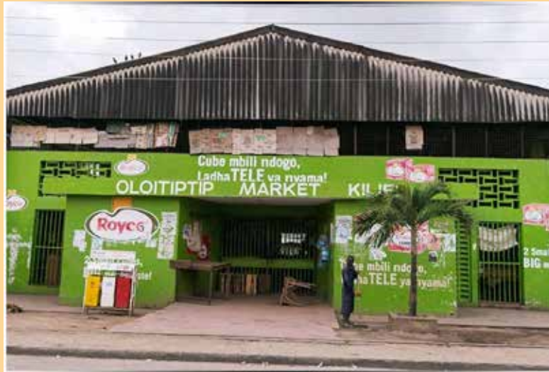
The Old Oloiptip Market fitted with Asbestos Roofing.