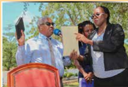
Members of the Municipality of Kilifi Board taking their oath of office during the official swearing in of the board