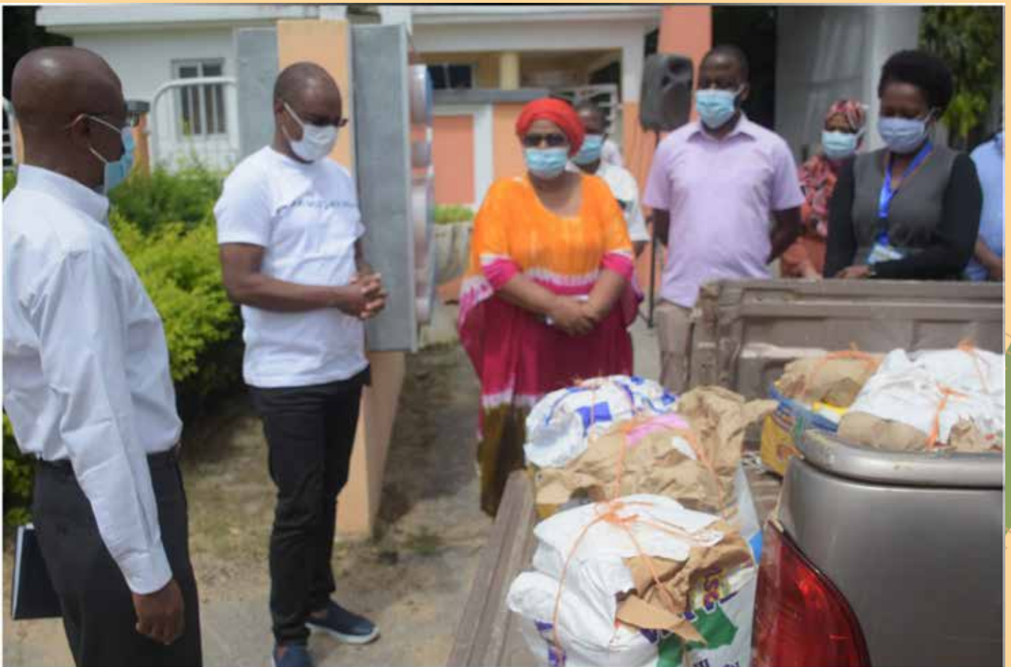
H.E. The Governor Amason Kingi receiving food donations towards the Covid-19 pandemic from the Municipality Board of Kilifi.

Receiving the donations from the Municipal Board of Kilifi at his office on 12th May, the Governor thanked the Municipality for forging such a noble partnership with Kesho Kenya and termed it as a big boost to the County government efforts.