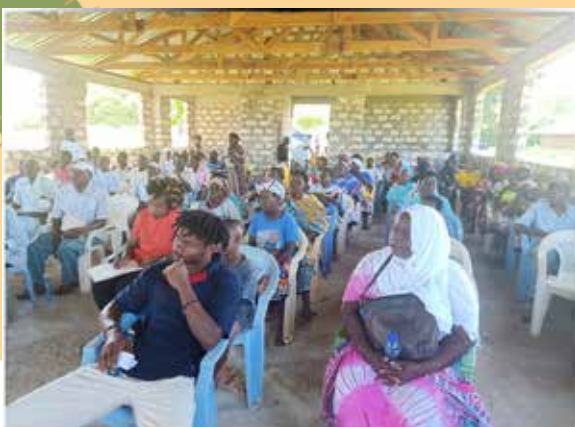
Kibarani Ward residents attending a Citizen public Participation Forum..