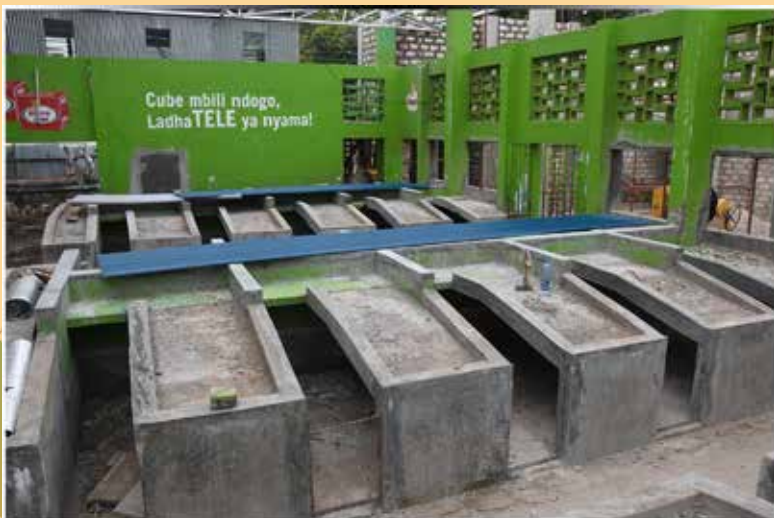
Ongoing refurbishment works on the Oloiptip Market.