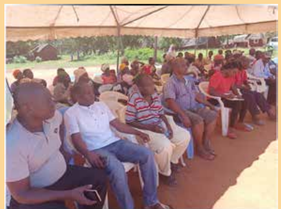
Tezo Ward residents attending a Citizen Public Participation Forum..